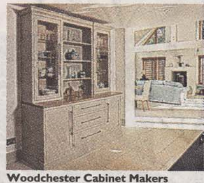
Woodchester Cabinet Makers

The website www.strouddecorativetrail.co.uk even includes suggestions of where to go for lunch.