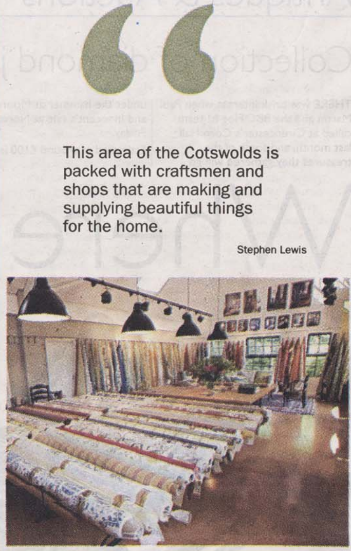
The showroom at Lewis & Wood

For more details, see the website www.strouddecorativetrail.co.uk