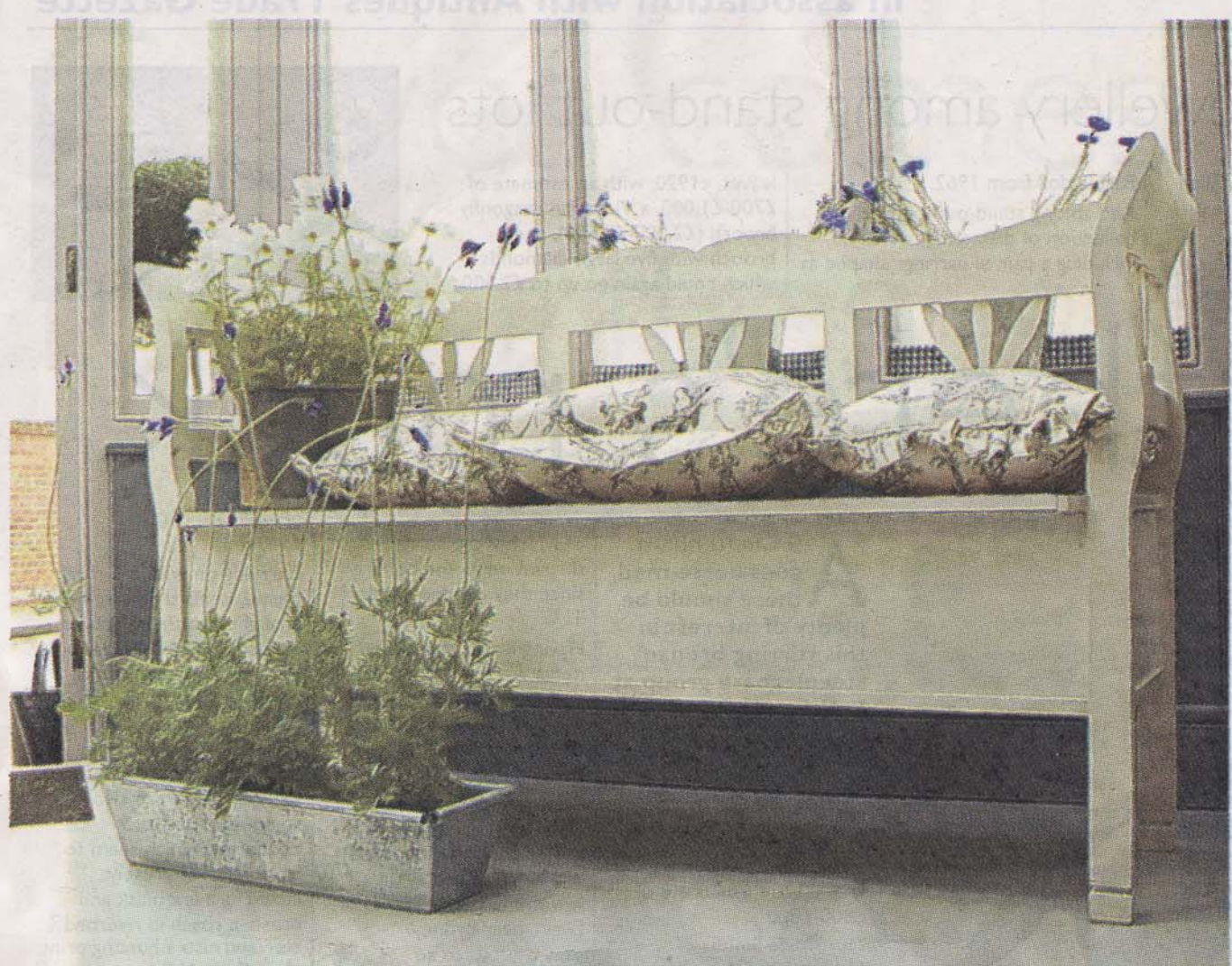
Scumble Goosie makes beautiful furniture

"We don't compete with each other and our customers are looking for similar things.