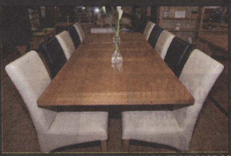
BEAUTIFUL OAK AND ASH TABLES FROM £295.00